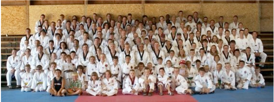
Blue Wave Summer Camp, 2005.

The board of directors meets at quarterly black belt meetings (roughly in January, March, August, and November of each year). The Association also holds two weekend-long training sessions per year for Blue Wave students: a <u>Winter</u> <u>Camp</u> generally held the first weekend of March, and a <u>Summer Camp</u> generally held the first weekend of August.