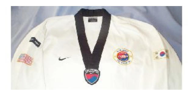
Blue Wave black belt dobak showing proper placement of patches.

The dobak is tied with a cloth belt, the color of which signifies the rank of the student. When tied properly, the belt should be wrapped so that it appears as a single layer around the back, and the two loose ends should hang at even lengths on either side of the knot. If your belt has a stripe, the stripe should be on the end hanging on your right as you look down at it.