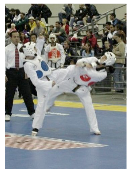
A modern Taekwondo free-sparring match. Note the use of head protectors and hogus .

Free-sparring, often referred to simply as "sparring," should not be confused with one-step sparring, often referred to as "<u>one-steps</u>." One-step sparring is not a competition, but a choreographed series of Taekwondo techniques designed as a response to a defined attack by an opponent. In contrast to poomse , one-steps require working with a partner, and in this way help develop skills of timing, positioning and distancing yourself relative to an attacker. One-steps are non-contact exercises, so the full range of Taekwondo techniques can be employed.