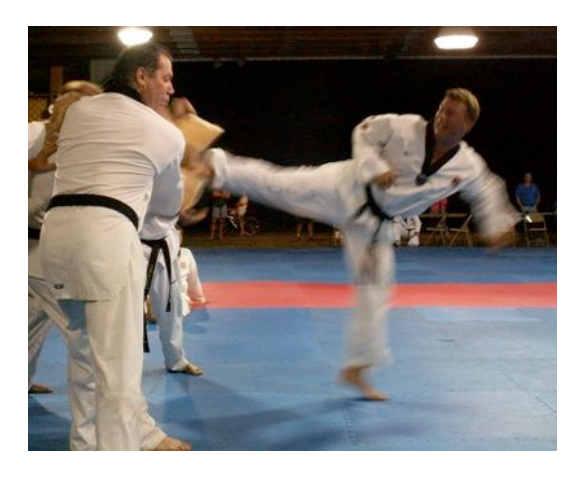
Examples of challenging Taekwondo boardbreaking techniques.

Should physical conflict be unavoidable, we teach practical defenses against common street-fighting attacks; many of these defenses and counterattacks draw directly from Taekwondo techniques. In addition, as fights are unpredictable yet have many common features, we teach ways of defending and counterattacking in various stages of a fight, even if you find yourself in an undesirable position.