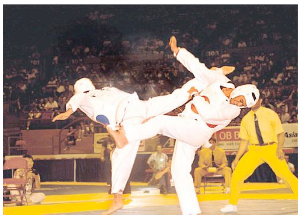
Taekwondo as an Olympic-level sport.

The Blue Wave is fortunate in that it draws on strong resources in both aspects of Taekwondo. It is very active in the sport, hosting tournaments, seeking cutting edge training methods, and producing many talented, nationally ranked fighters. Through its lineage to Kukkiwon and Chung Do Kwan, it is also devoted to teaching and preserving the martial art.